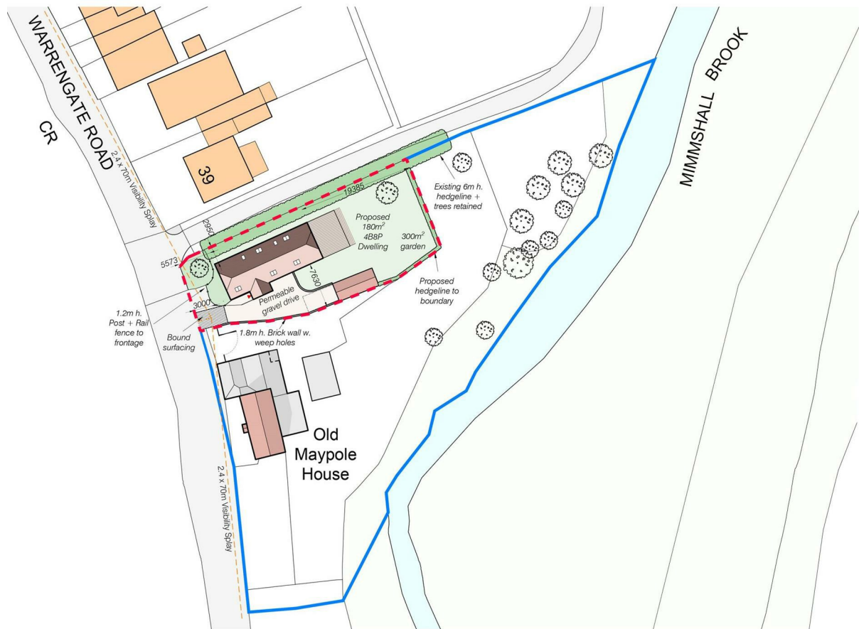
PROPOSED BLOCK PLAN @ 1:500